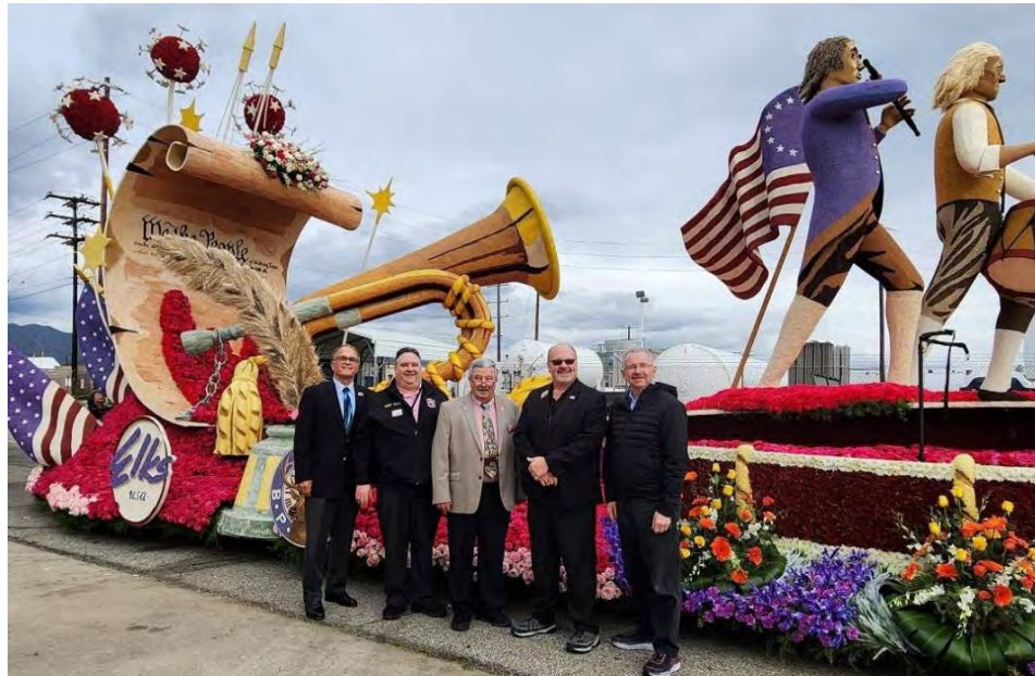
Past and present Grand Exalted Rulers with the 2024 Rose Parade Float representing the Chimes of Liberty and honoring Veterans